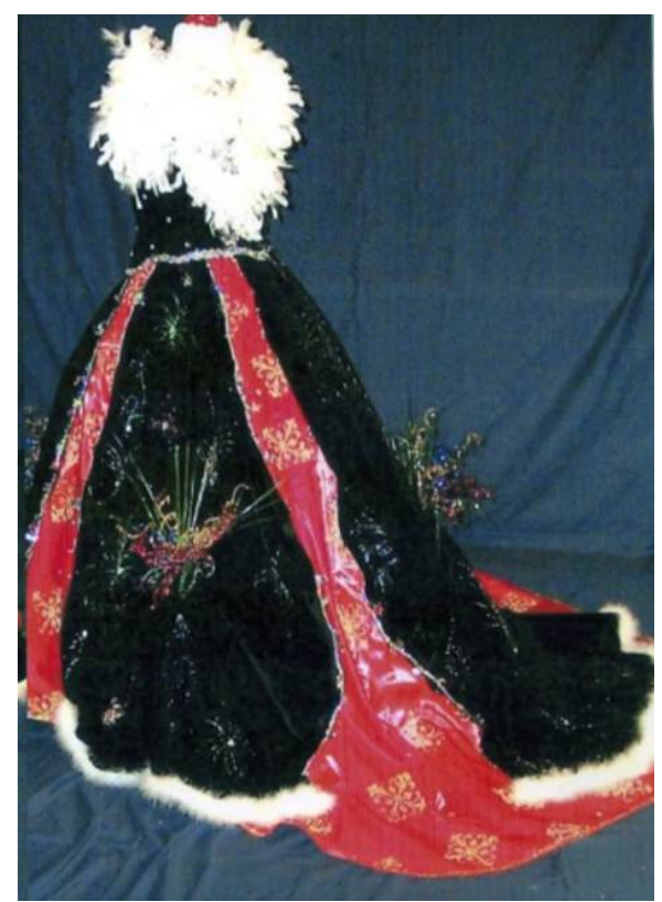
2002 Festival of Louisiana, Fireworks. Gold pattern was stamped after the gown was constructed.

The sewing area consists of my machine and a pressing table with the dress form in the middle of the L. It is easily accessed from the sewing area and the worktables.