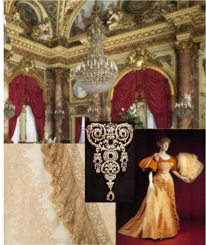
Inspiration Page. Background: Dining Room of The Breakers, Newport, RI. Bottom left to right: fabrics from Worth Gown, brocade, lace, beaded border Cartier Collection Diamond Stomacher, and Worth Gown on mannequin.

June-July . The alterations begin with the Louisiana seamstresses. While we hope to only alter the side seams, sometimes we must nip at the Princess seams and shift the pleats to take in or release extra fabric at the waistline seam.