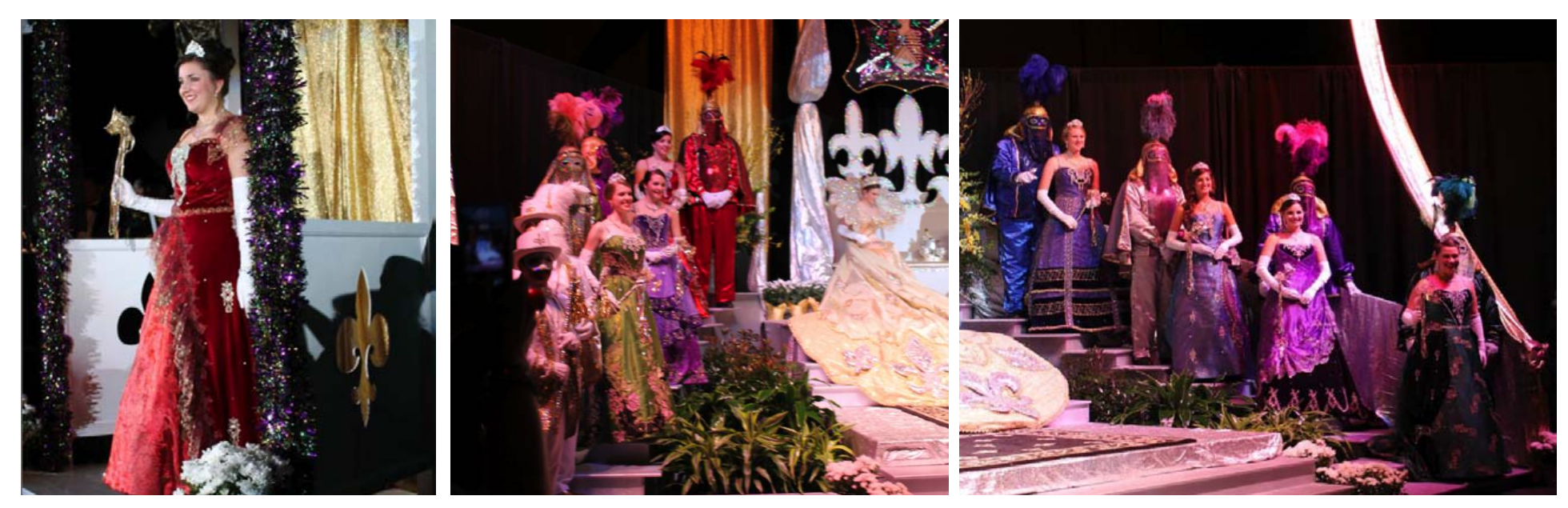
Formal introduction at ball (left). Princesses with Dukes stage left - Queen seated far right (center). Princesses with Dukes, stage right (right)

exhausted. The pressure of creating for such an event is great, and this year's Ball was more demanding than most. I never want to disappoint anyone.