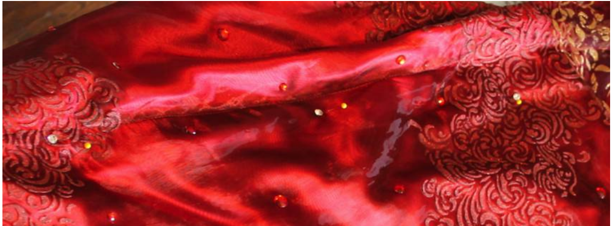
The embossed patterns are designed to overlap at a seam so the pattern is not interrupted.

December-January. The reveal! Finally the gown is ready to be photographed and privately revealed to the Princess and her family — well intentions and planning aside — often just in time for the Ball (right and next page).