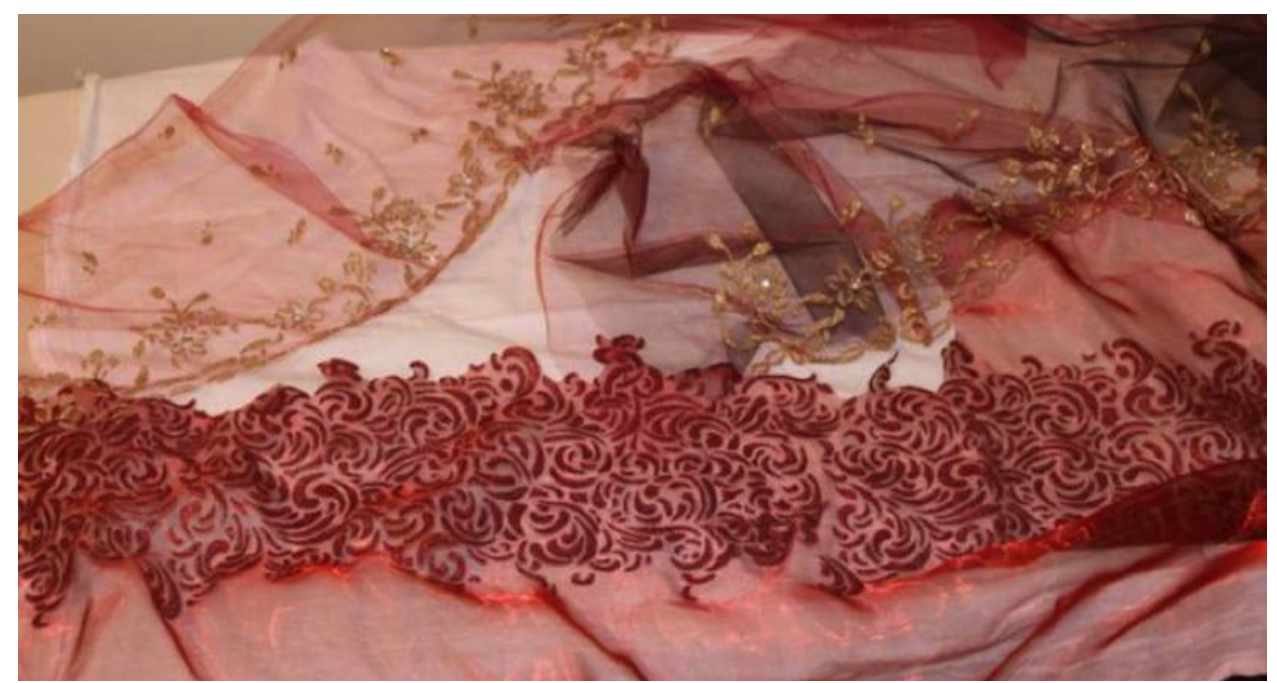
Tone on tone embossed brocade pattern, to be used on bodice and as trim between lace ruffle and velvet on skirt

repeats of a pattern, which I time and weigh the paste to know how much the design will cost to produce.