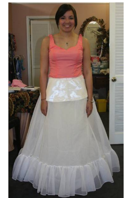
Princess in sample bodice, color coded for sizing (above). Each Princess is asked to send of photo of their favorite formal (below).

March. While waiting for the Board's approval, I organize my workspace and try not to invest my heart in the theme—which isn't always approved. After approval, I