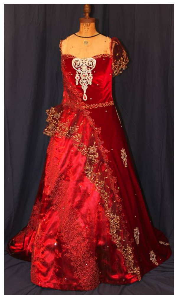
The big reveal -- a finished ball gown read for viewing.

What begins the week after the Ball sometimes doesn't reach completion until the day before the next Ball. While no plan is ever designed to finish late, we all know how issues tend to crop up along the way. It is quite a journey. I have repeated this process for 13 consecutive years. As I write this I can honestly say I am emotionally