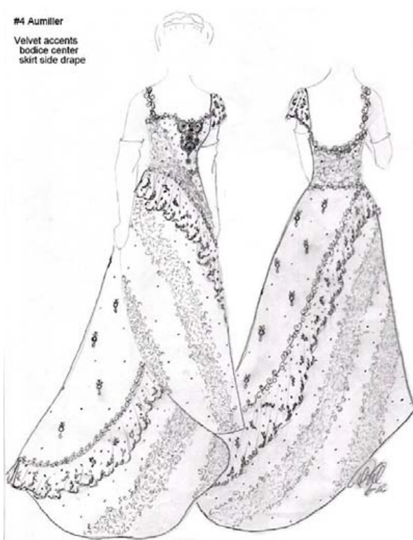
Croquis that works well for me and can be converted easily to life-sized patterns.

myself, which I keep in an 8 ½ x 11-inch portfolio binder. The binder holds the inspiration pages, sketches, scaled patterns for embossing, the measurement worksheet with pictures from sample bodice fittings, along with a composite of the Princesses favorite dress pictures.