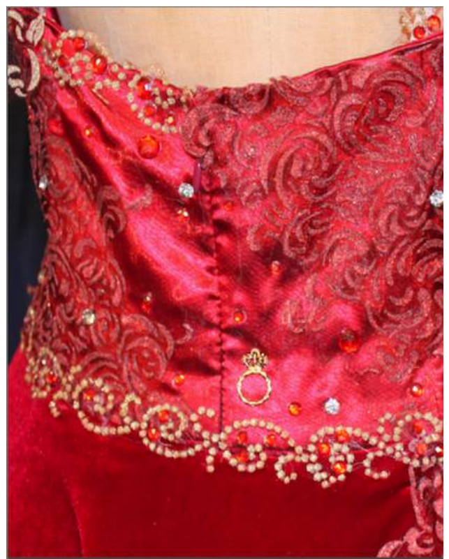
Bustle Ring is sewn through the waist stay, just to right of zipper, to keep the weight of the train off of the shoulder straps when bustled.

For the last ten years, I have worked with a lady in Colorado, who works magic with hot glue. I design the borders so that they overlap and appear seamless. It is similar to putting a puzzle together but every bit worth the effort (below). After all of the sheers are applied to the skirts, the bodices are trimmed out with embossed parts, sequins, colored acrylic and crystal rhinestones.