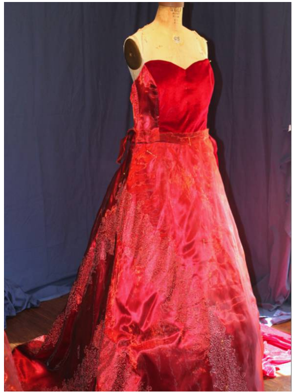
Sheer overlay The tone on tone brocade pattern was embossed on the organza. Then the sheer was applied to the skirt of the gown.

October. As the embossing process winds down, the final gown assembly gears up. The sheers are attached to the skirts. Some require that the lower part of the zipper be removed and the sheer inserted into the zipper, while others can have a placket over the zipper as an overlay conceals the zipper. The sheer is zigzagged over the waistline seam with a straight stitch above and below it to keep it from raveling, and then the seam allowance is trimmed away. A combination of trim and stones camouflage the seam line (below).